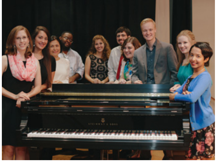
University of Mobile students aglow with joy!