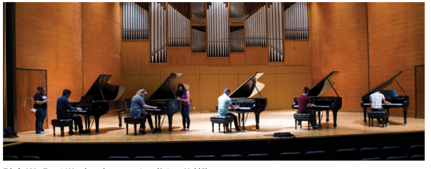
Take five? West Texas A&M students rehearse on a quintet of Steinway Model B's.

Good things happened after WTAMU representatives attended Steinway's Keys to Finding Funds Seminar in New York. The slow and steady climb reached an astonishing peak in 2016 when 50 uprights and grands by Steinway & Sons were delivered to faculty studios, practice rooms, and classrooms. "We also have